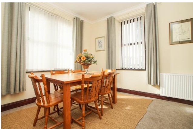
RECEPTION ROOM 1