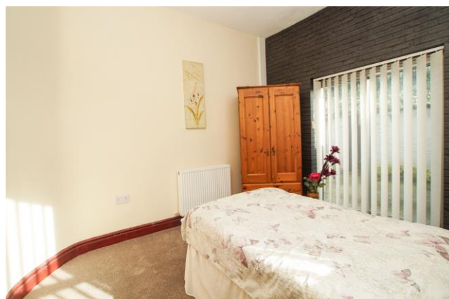
RECEPTION ROOM 2

RECEPTION ROOM 3 (15' x 12'8) UPVC window to the side, coving to ceiling, radiator and fireplace with wooden mantle and pillars.