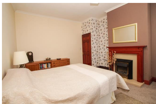
RECEPTION ROOM 3

INNER HALLWAY Staircase to the first floor, understairs storage cupboard with light and power sockets, door to dining kitchen.