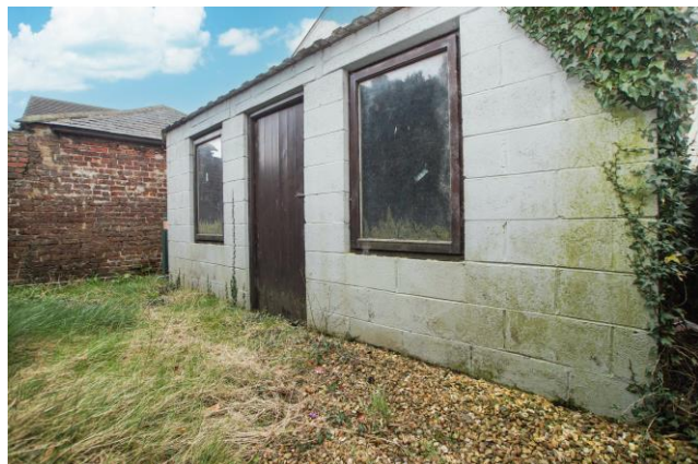
REAR YARD & OUTHOUSES