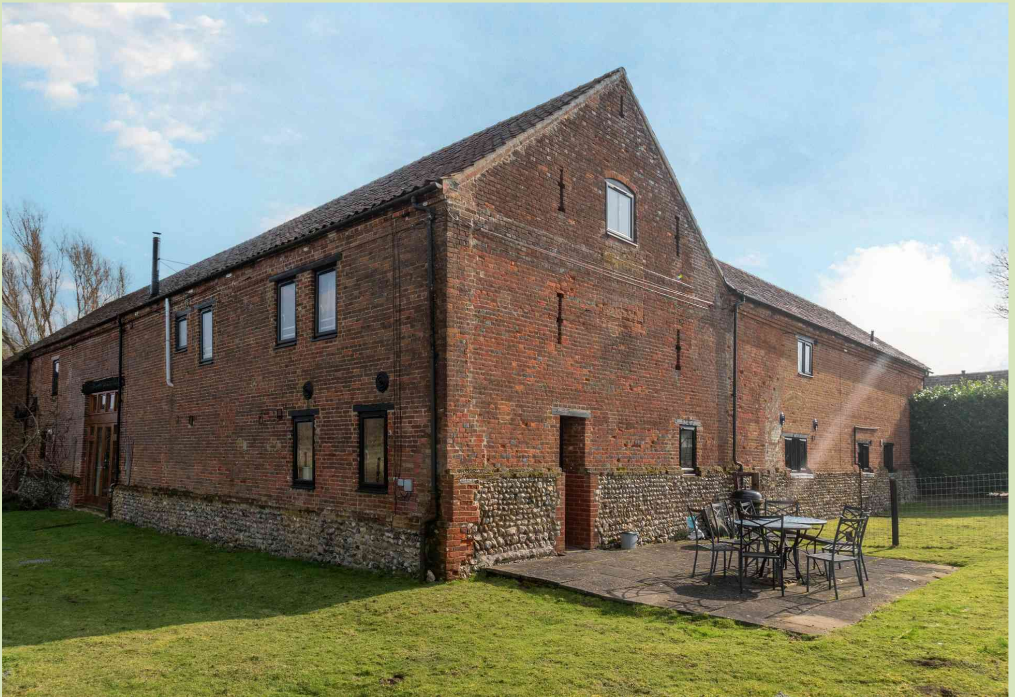
Granary Barn, Cannister Hall, Toftrees Guide Price £325,000