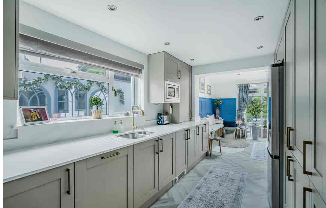
87 Marlow Bottom, Marlow, Buckinghamshire SL7 3NA Guide Price £1,050,000 - Freehold