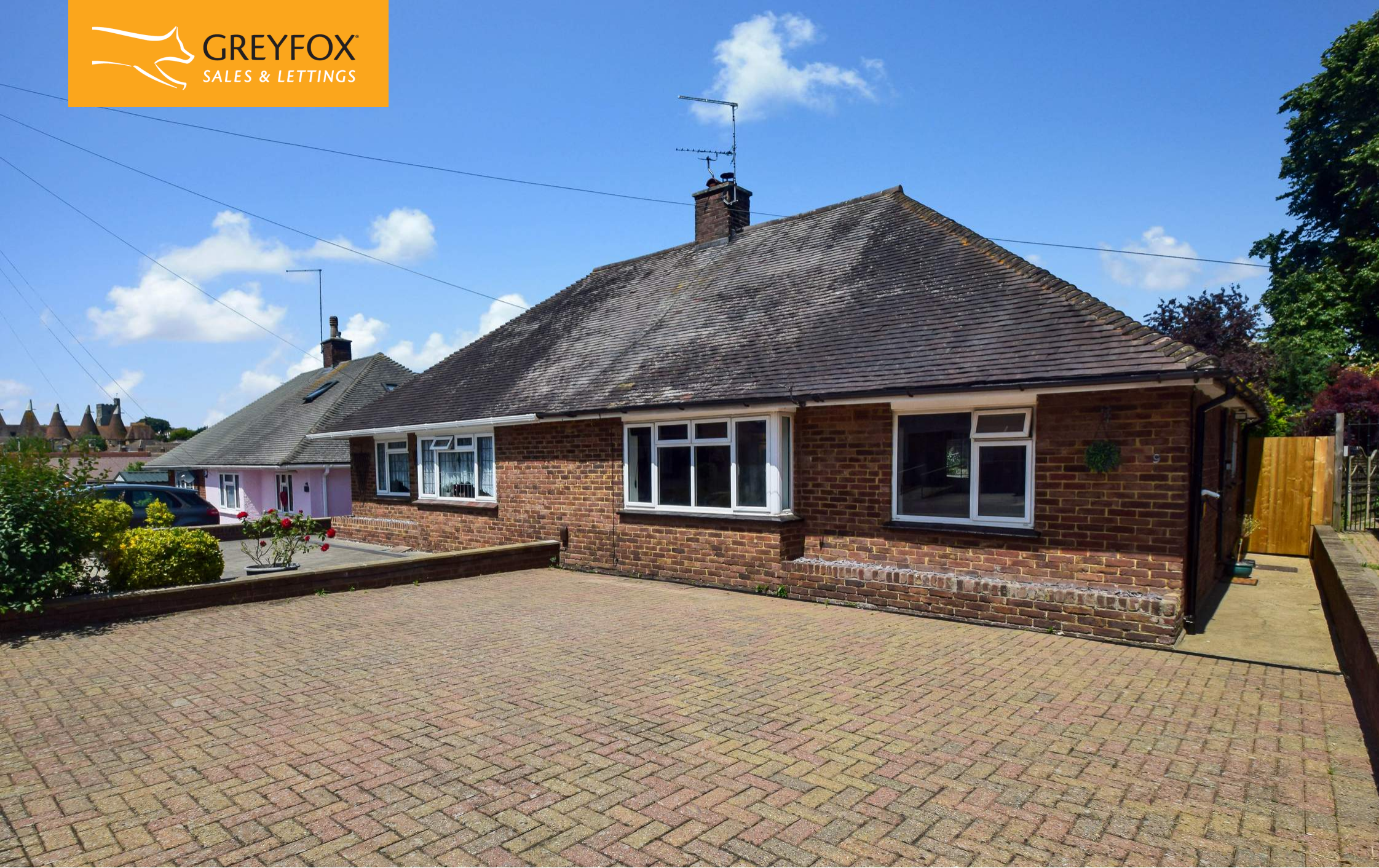
Two Bedroom Semi-Detached Bungalow Mierscourt Close, Gillingham, Kent, ME8 8JD