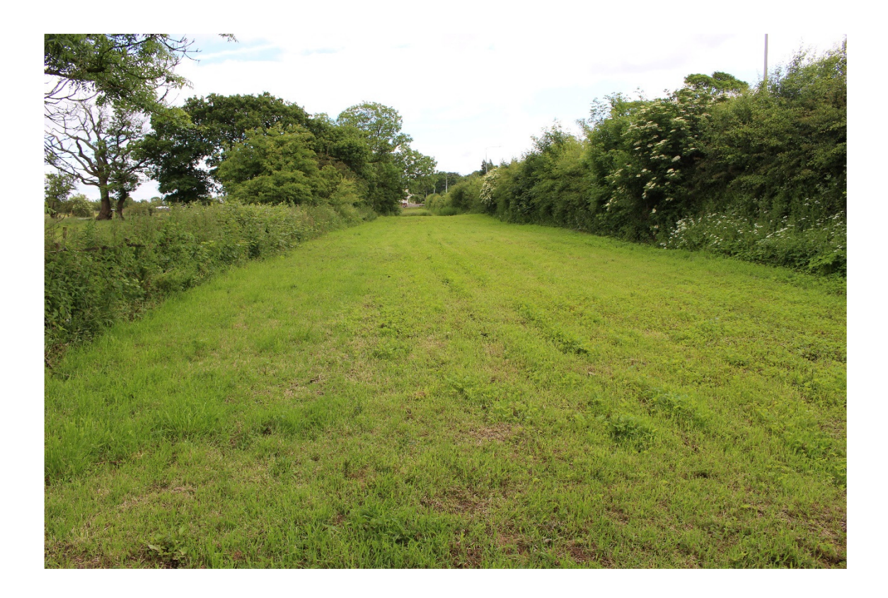
0.25 acre plot looking north