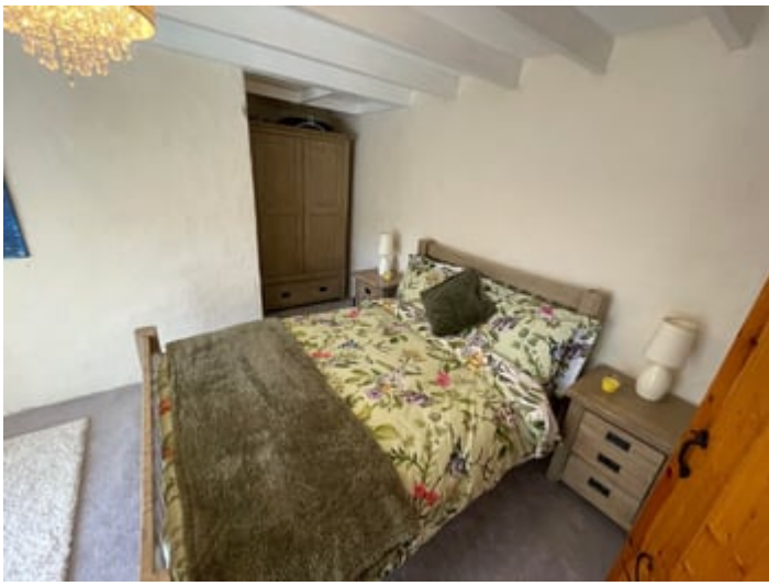
Front single bedroom 3

8' 5" x 6' 4" (2.57m x 1.93m) Window to front.