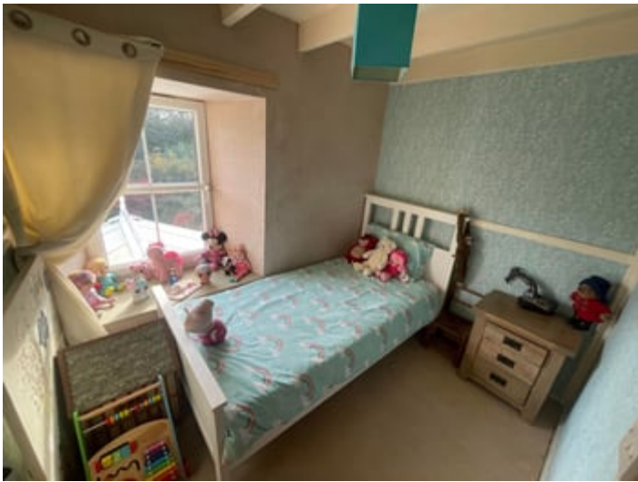
Front Principal Bedroom 4

8' 5" x 6' 4" (2.57m x 1.93m) Window to front.