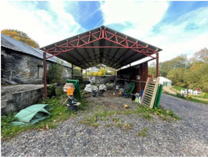
Range of stone outbuildings