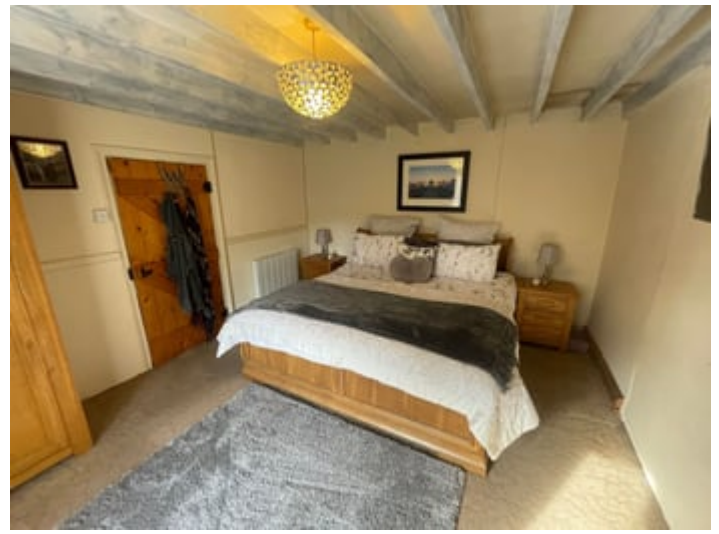
Annex / Overflow accommodation