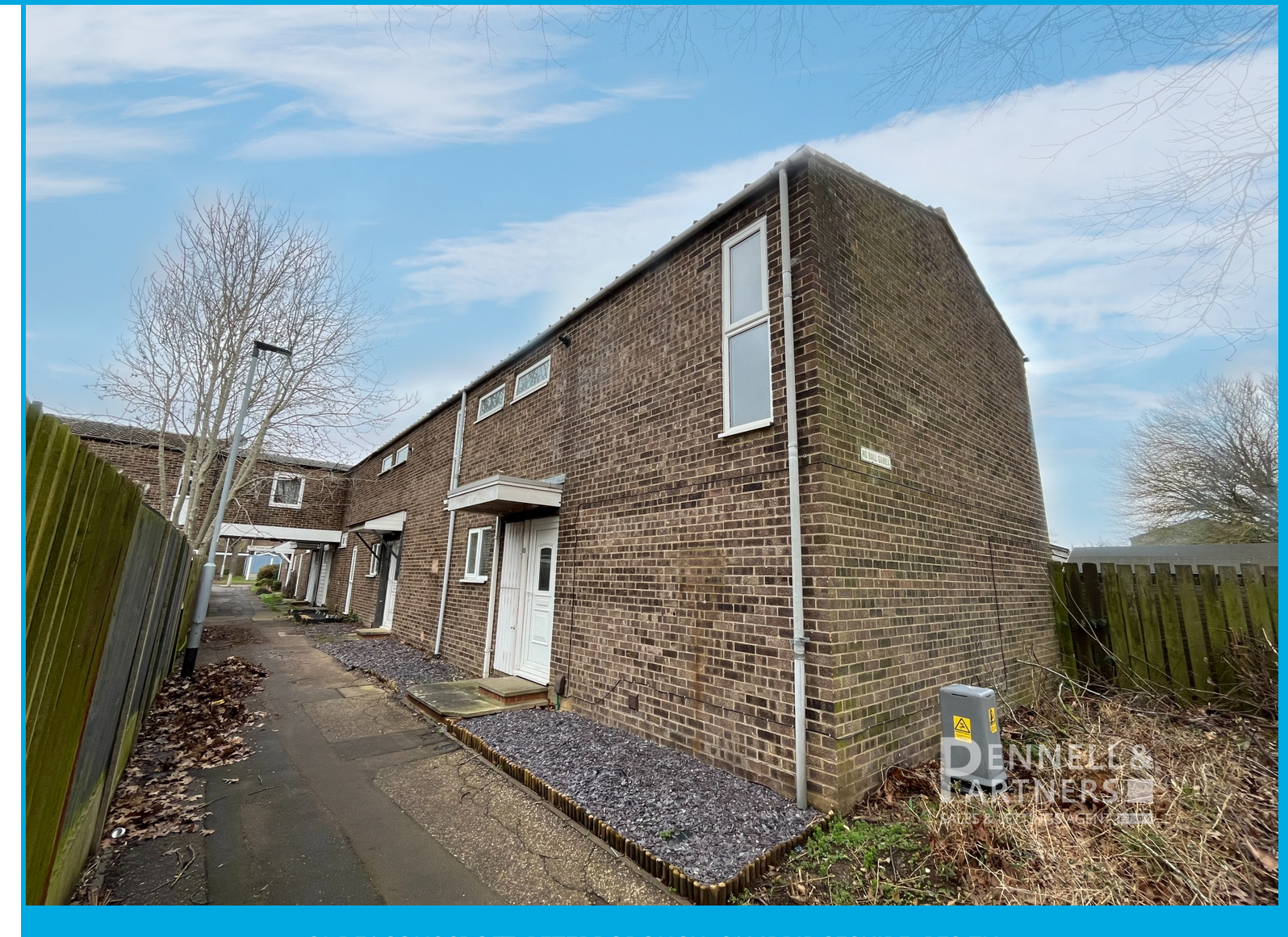
61 DEACONSCROFT, PETERBOROUGH, CAMBRIDGESHIRE. PE3 7LJ