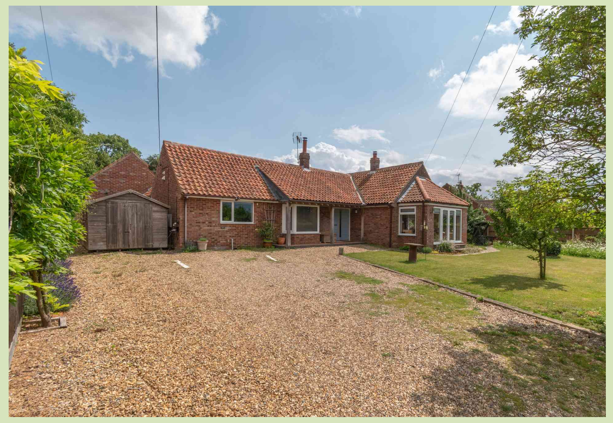
The Old Wash House, Sculthorpe Guide Price £500,000