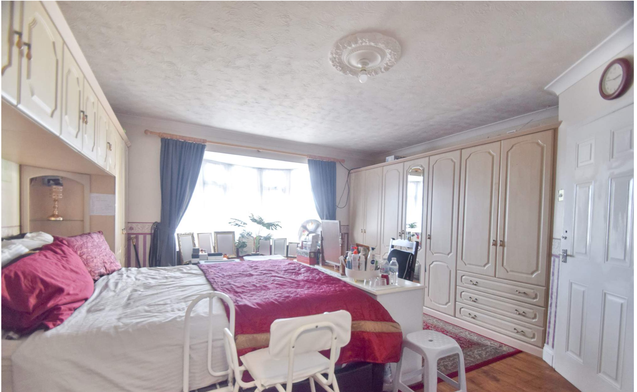
FEATHERBY ROAD, TWYDALL, RAINHAM, GILLINGHAM, KENT, ME8 6BB