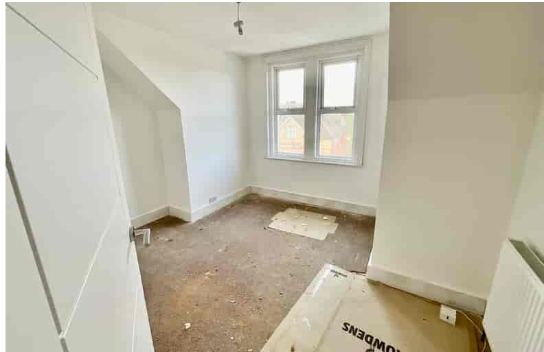
TOP FLOOR 571 sq.ft. (53.0 sq.m.) approx.