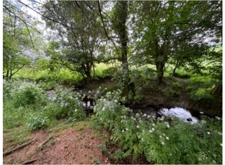
COTTAGE STYLE GARDENS

Directly to the rear of the property lies a level lawned garden area with mature shrubs and trees with concrete paths surrounding the cottage for ease of access. To the front of the property lies a veranda with a delightful seating area to enjoy the late Summer evenings.