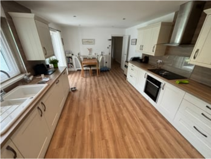
KITCHEN/DINER (THIRD IMAGE)