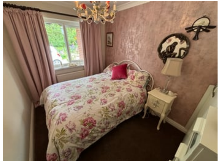
FRONT BEDROOM 2

10' 5" x 7' 7" (3.17m x 2.31m). With radiator.