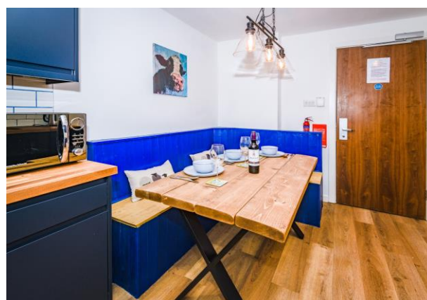
DINING KITCHEN AREA

LOUNGE/BEDROOM AREA Wardrobe with mirror fronted sliding doors, UPVC double glazed window with blackout blind, UPVC double glazed French doors with blackout blind opening onto the private patio area.