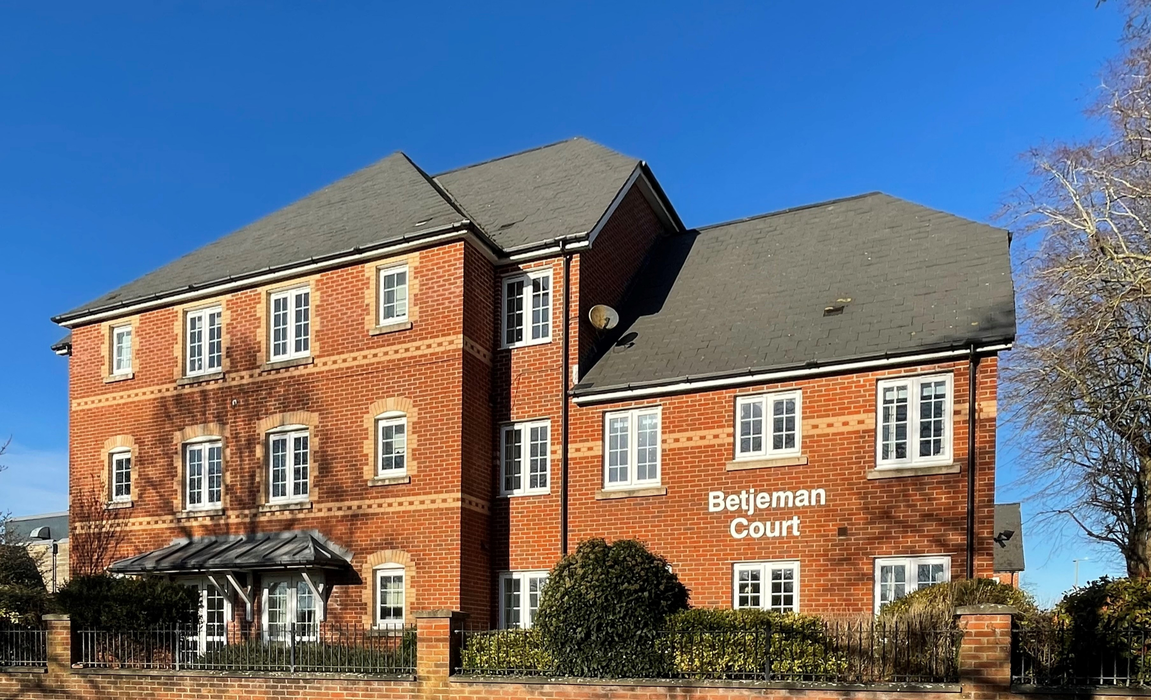
Betjeman Court, Wantage OX12 9BW Oxfordshire, £145,000