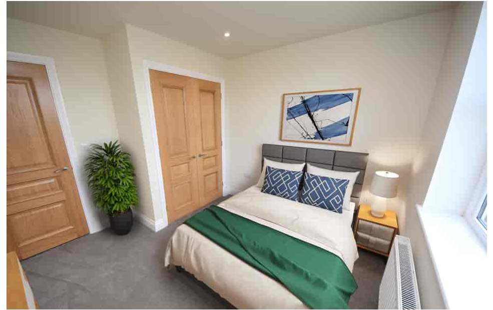
8 The Old Elephant & Castle, Causeway, Banbury, Oxfordshire. OX16 4SN Guide Price £247,000 - Share of Freehold