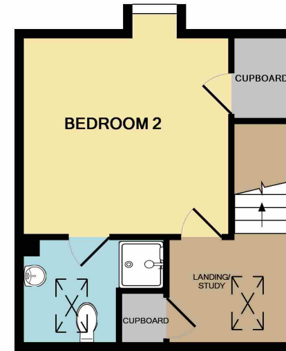
2ND FLOOR APPROX. FLOOR AREA 241 SQ.FT. (22.4 SQ.M.)

TOTAL APPROX. FLOOR AREA 995 SQ.FT. (92.4 SQ.M.) Whilst every attempt has been made to ensure the accuracy of the floor plan contained here, measurements of doors, windows, rooms and any other items are approximate and no responsibility is taken for any error, omission, or mis-statement. This plan is for illustrative purposes only and should be used as such by any prospective purchaser. The services, systems and appliances shown have not been tested and no guarantee as to their operability or efficiency can be given Made with Metropix ©2017