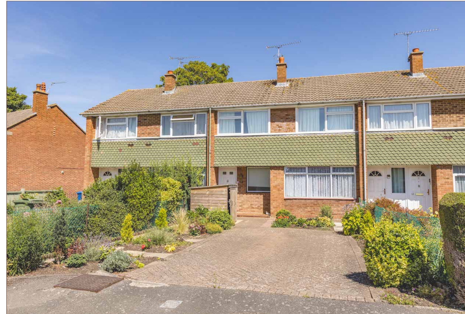
A Three-Bedroom Home with Driveway Parking in Talbot Place, Datchet – No Onward Chain

Set in a popular location within easy reach of Datchet village centre, this three-bedroom terraced home in Talbot Place offers generous space, a practical layout, and a great opportunity to make it your own.