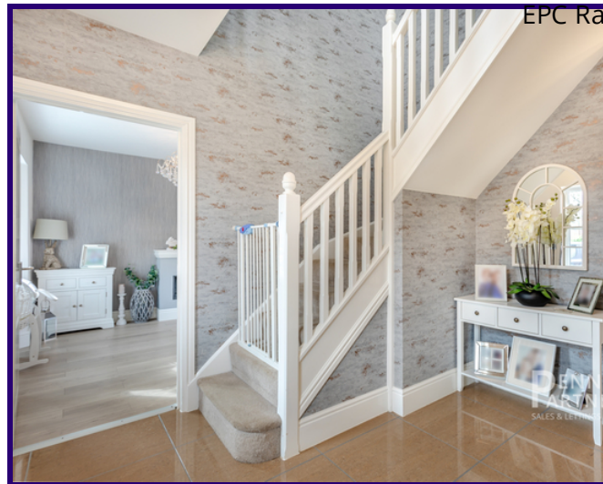
EPC Rating: B (84)

Viewings are highly advised, contact our Sales team for further information or to arrange a viewing.