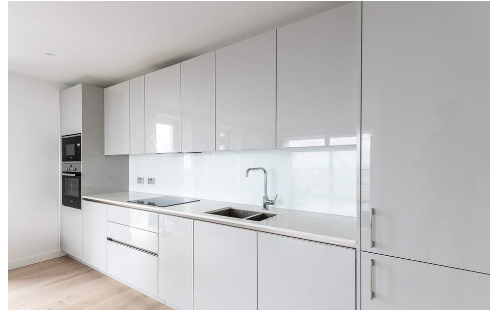
Apartment 1901 Hurlock Heights, Deacon Street, Elephant and Castle. SE17 1GE £860,000 - Leasehold