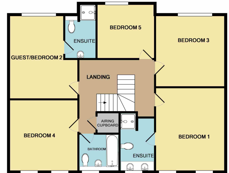
1ST FLOOR APPROX. FLOOR AREA 926 SQ.FT. (86.1 SQ.M.)