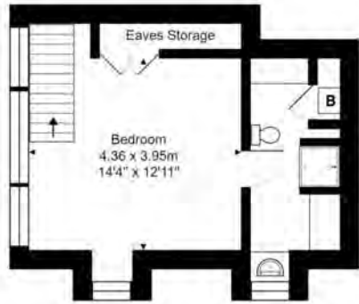
Annex First Floor Area: 29.4 m 2 ... 317 ft 2