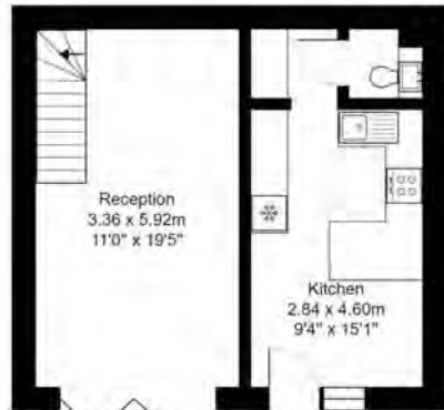
Annex Ground Floor Area: 37.9 m 2 ... 408 ft 2