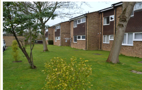
An immaculate one bedroom ground floor maisonette with fitted kitchen, radiator heating and a garage in a block behind