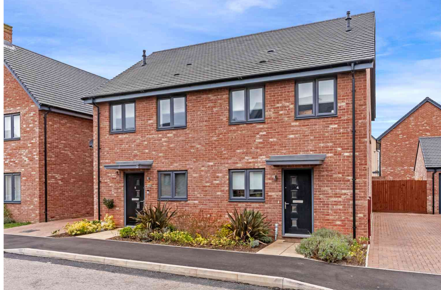
Pickering Way, Alconbury Weald PE28 4LP