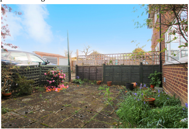
Garage Situated in block to rear, with metal up and over door.

Paved garden with shrub borders, enclosed by woodpanel fencing.