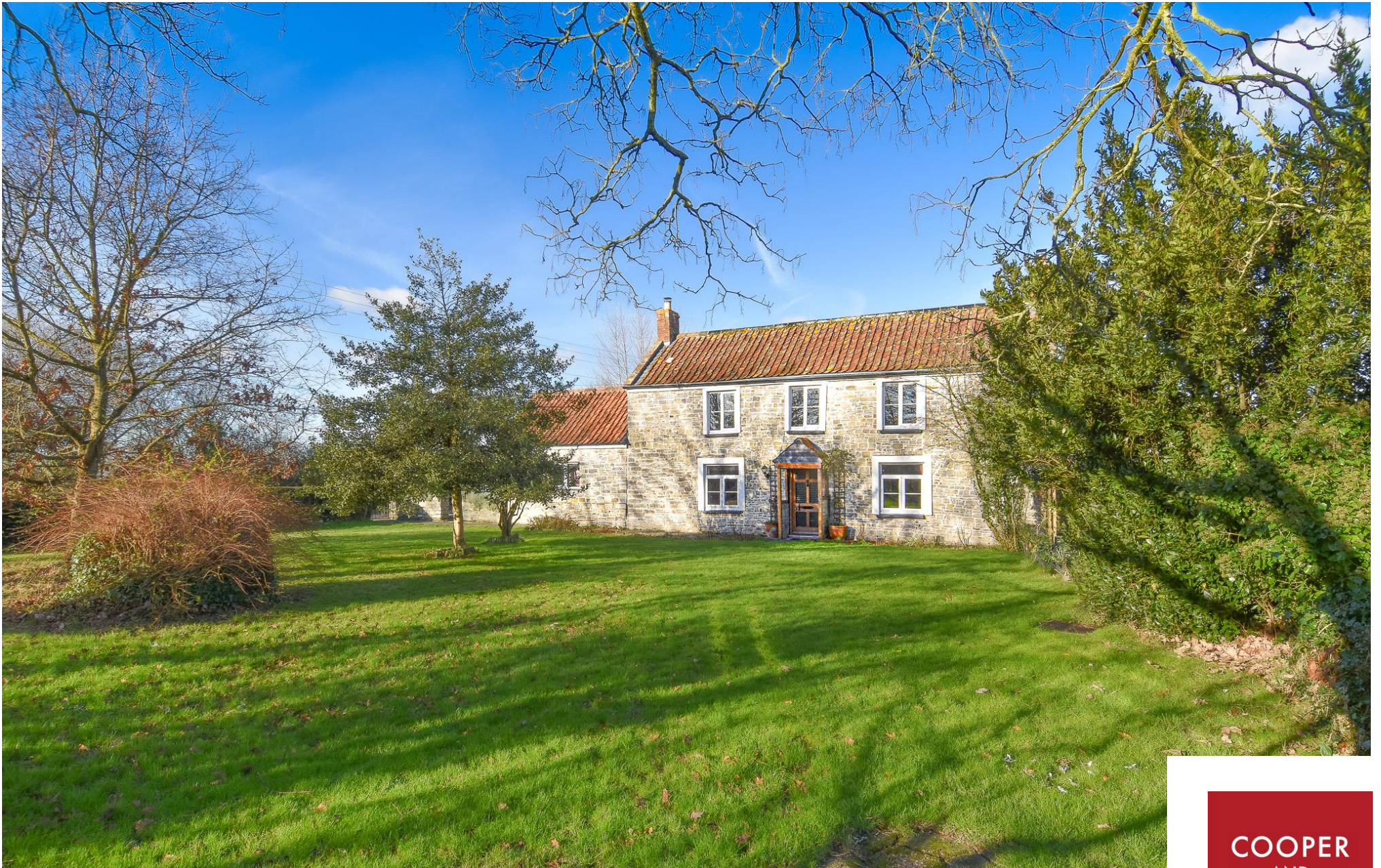
Holly House, Yarrow Road, Mark TA9 4LW