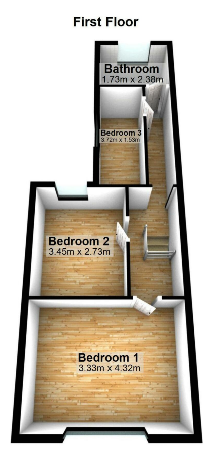
Knockhall Road, Greenhithe