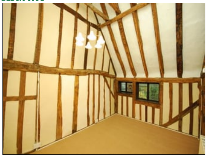
14'\ 7''\ x\ 10'\ (4.45m\ x\ 3.05m) two leaded light glazed windows to the rear, a vaulted ceiling with a wealth of exposed oak beams, radiator, carpet, door leads into an en suite shower.