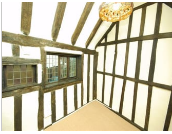
8' 2" x 7' 2" (2.49m x 2.18m) leaded light glazed windows to the front, a vaulted ceiling with a wealth of exposed oak beams, carpet.