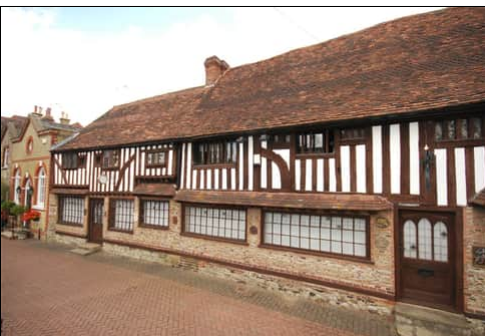
SEAL HOUSE 15 - 19 CHURCH STREET, SEVENOAKS, SEAL TN15 0AR

A sizeable historic landmark building forming the major portion of this special and spacious magnificent 16th Century Grade II listed period building. This interesting well proportioned 4/5 bedroom character property enjoys a wealth of period features including inglenook fireplaces, exposed oak beams and rooms with vaulted ceilings. There is no chain.