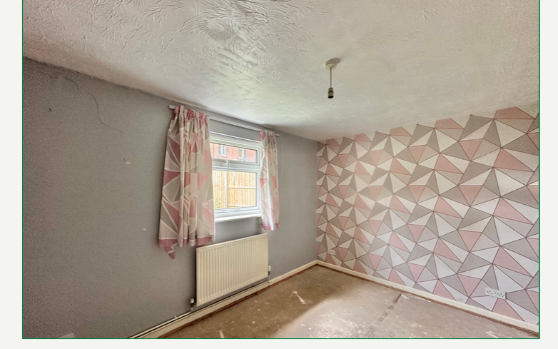
Price Guide £250,000