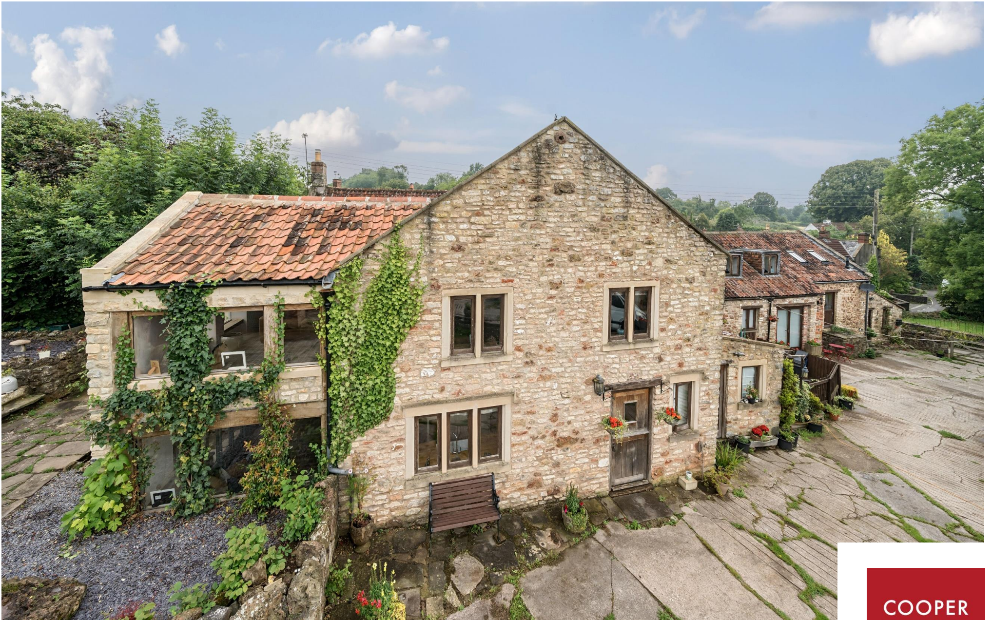
Old Norton Hall Farm, Bowden Hill, Chilcompton, BA3 4EN £1,200,000 Freehold