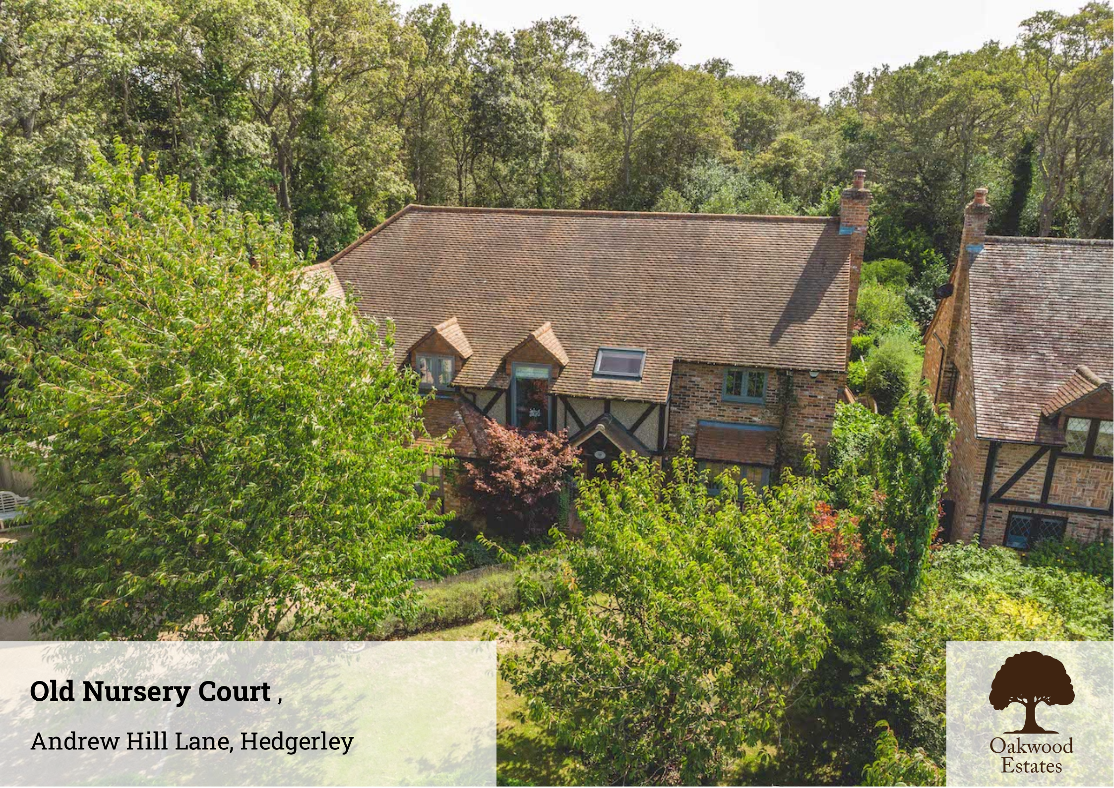
Old Nursery Court , Andrew Hill Lane, Hedgerley