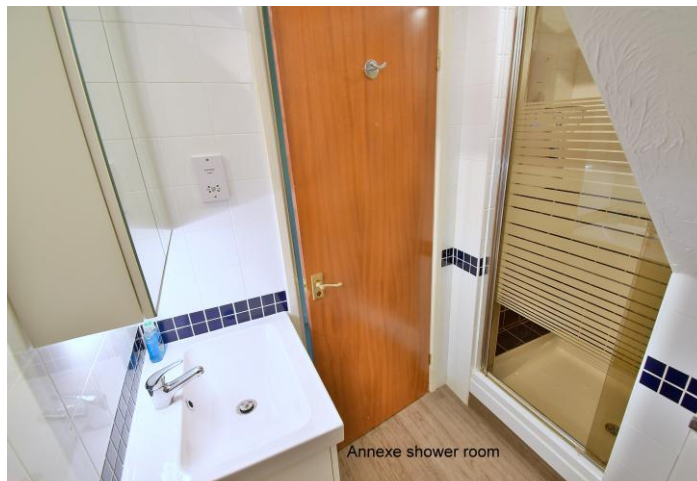
Annexe shower room