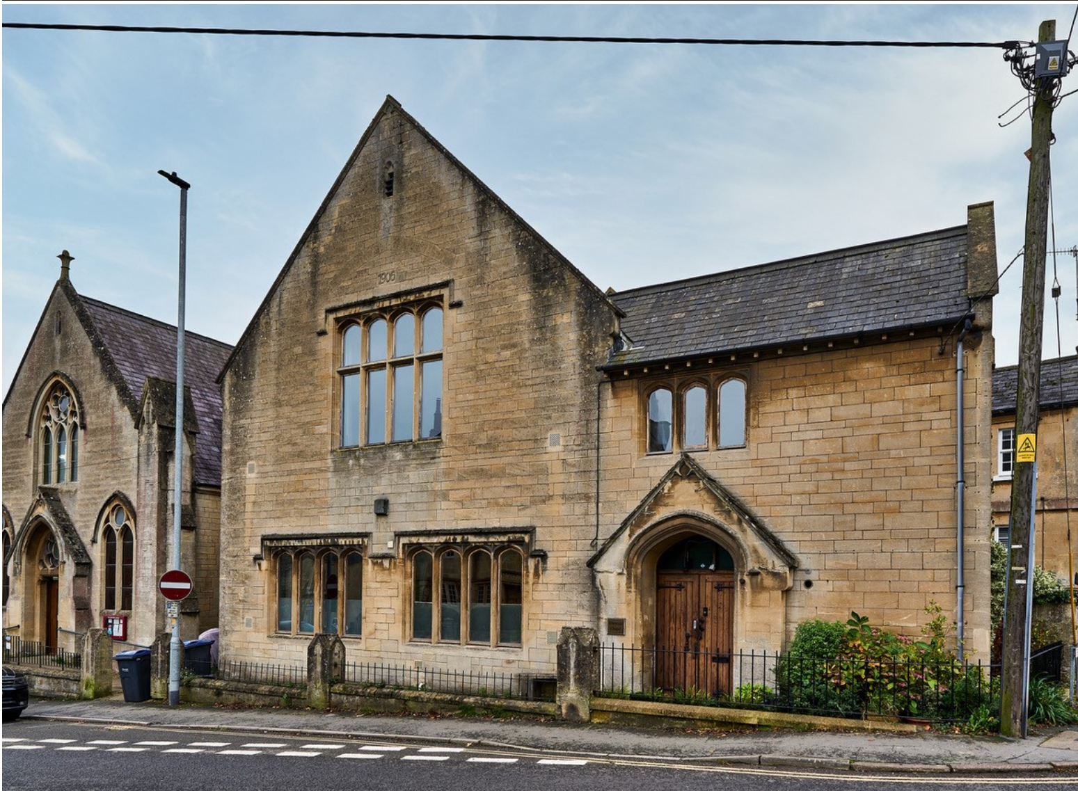
Box, Near Bath