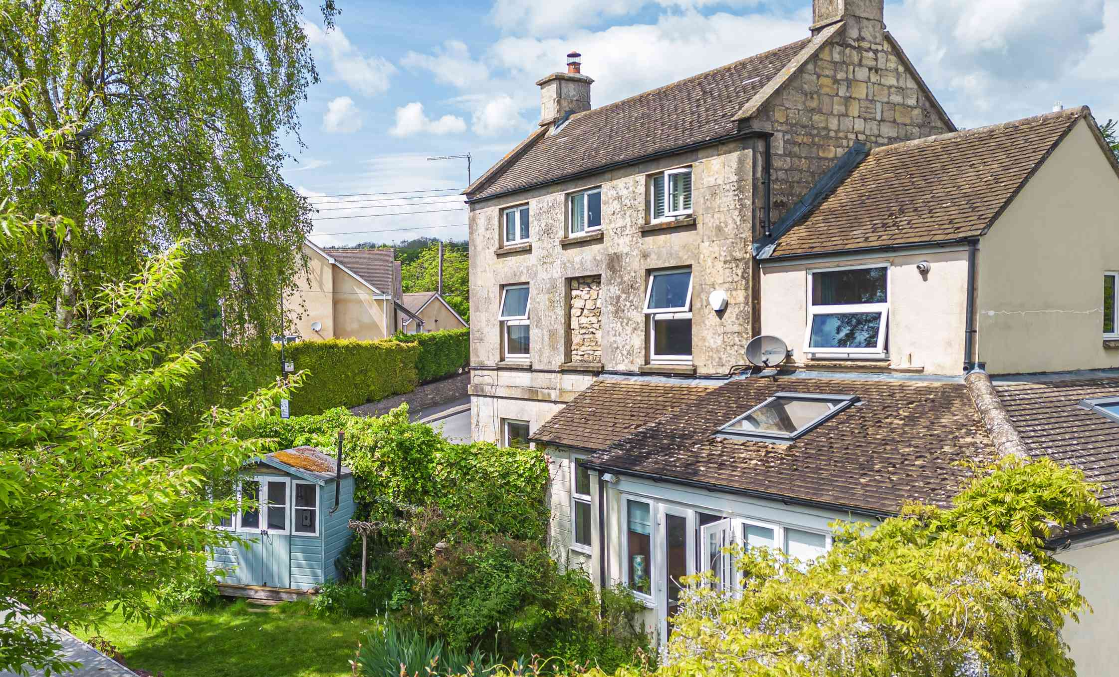
The Rockery, Upper Kitesnest, Whiteshill, Stroud, Gloucestershire, GL6 6BG Guide Price £550,000