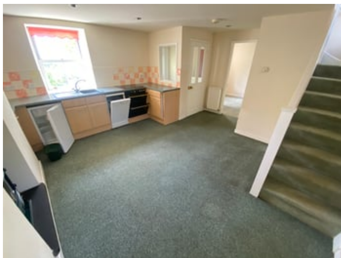
KITCHEN (SECOND IMAGE)

14' 7" x 15' 0" (4.45m x 4.57m). A modern fitted Kitchen with a range of wall and floor units, sink and drainer unit, integrated double oven, plumbing and space for dishwasher, space for under counter fridge/freezer, oil fired stove (not connected), radiator.