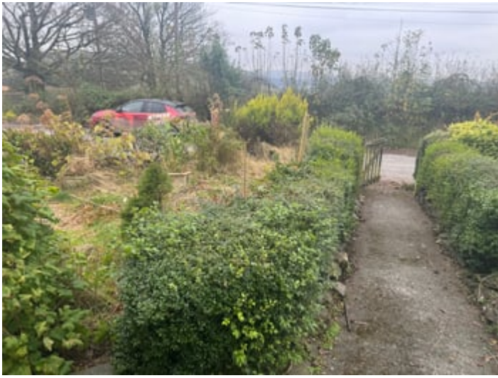
GARDEN (SECOND IMAGE)