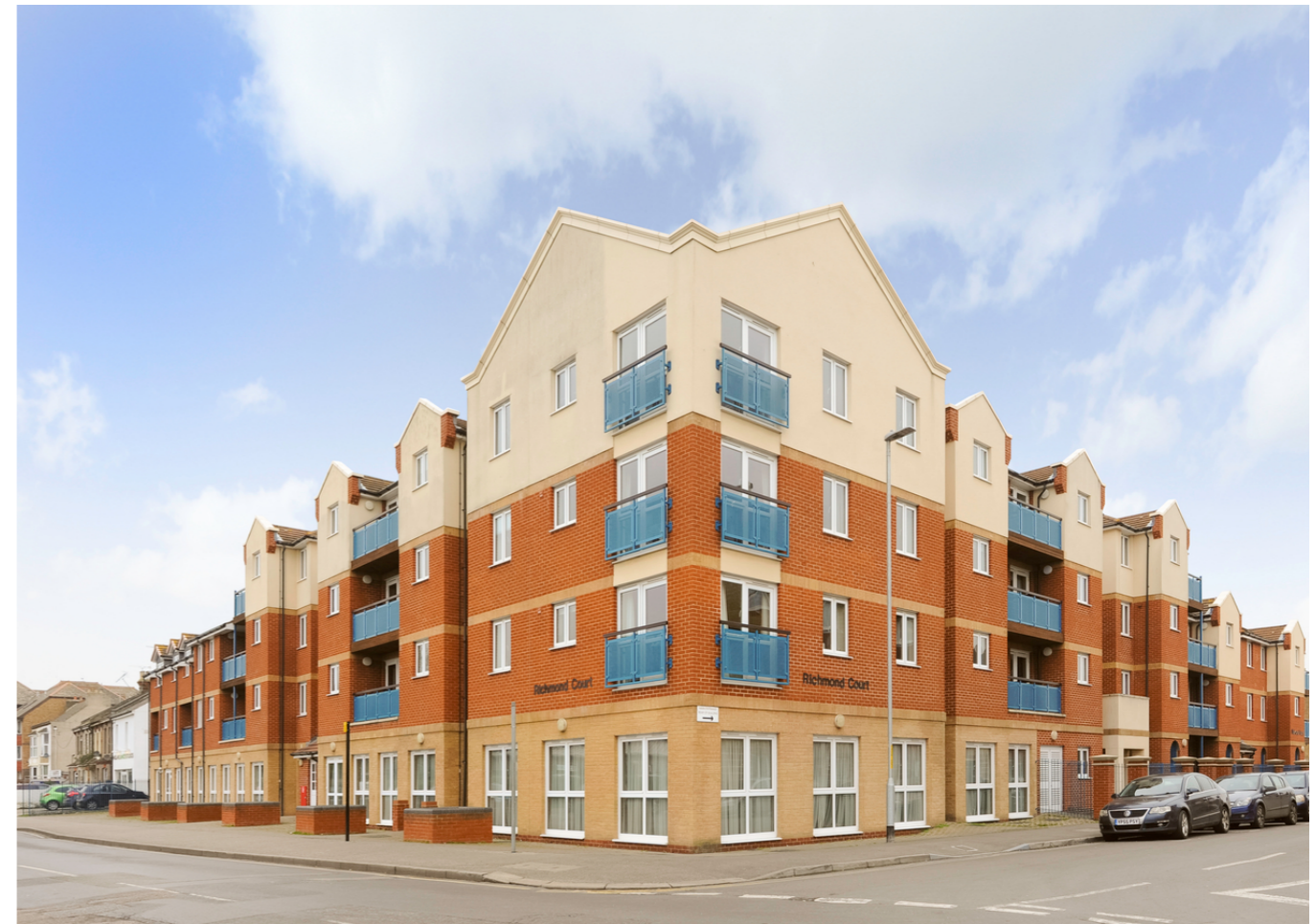
Flat 27 Richmond Court, Richmond Street, Heme Bay, Kent, CT6 5LL