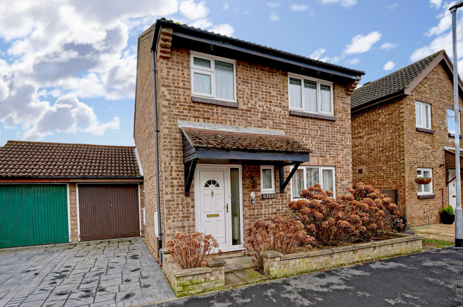
Wheatsheaf Road, Alconbury Weston PE28 4LF Guide Price £275,000