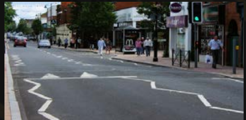
Fleet High Street