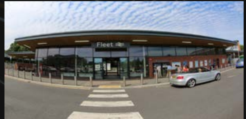
Fleet Mainline Railway Station