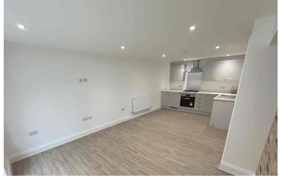
Flat 1, 21 Christchurch Road, Bournemouth, Dorset. BH1 3FJ £205,000 - Share of Freehold