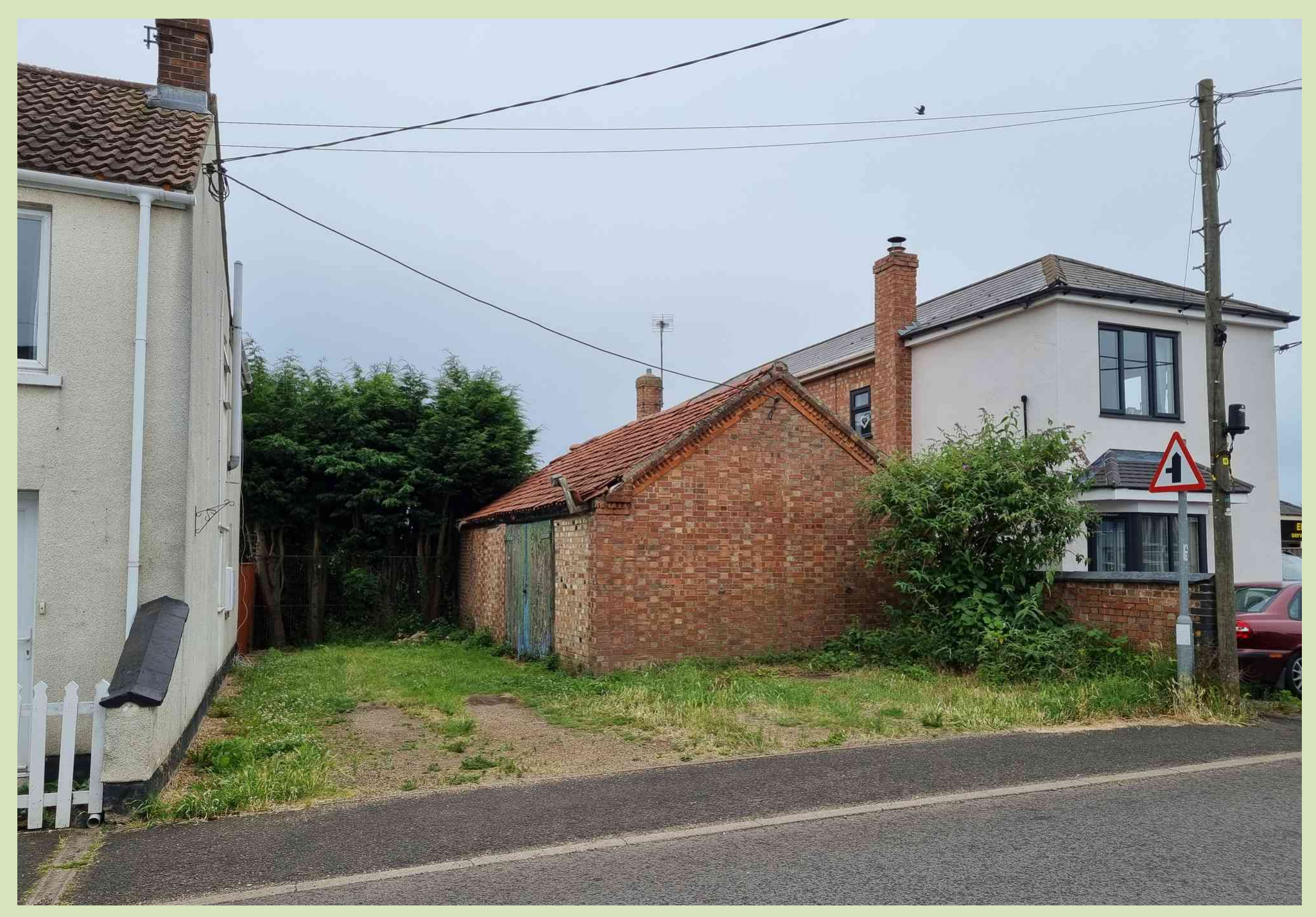
Barn adjacent to 48 Gaultree Square, Emneth Guide Price £40,000