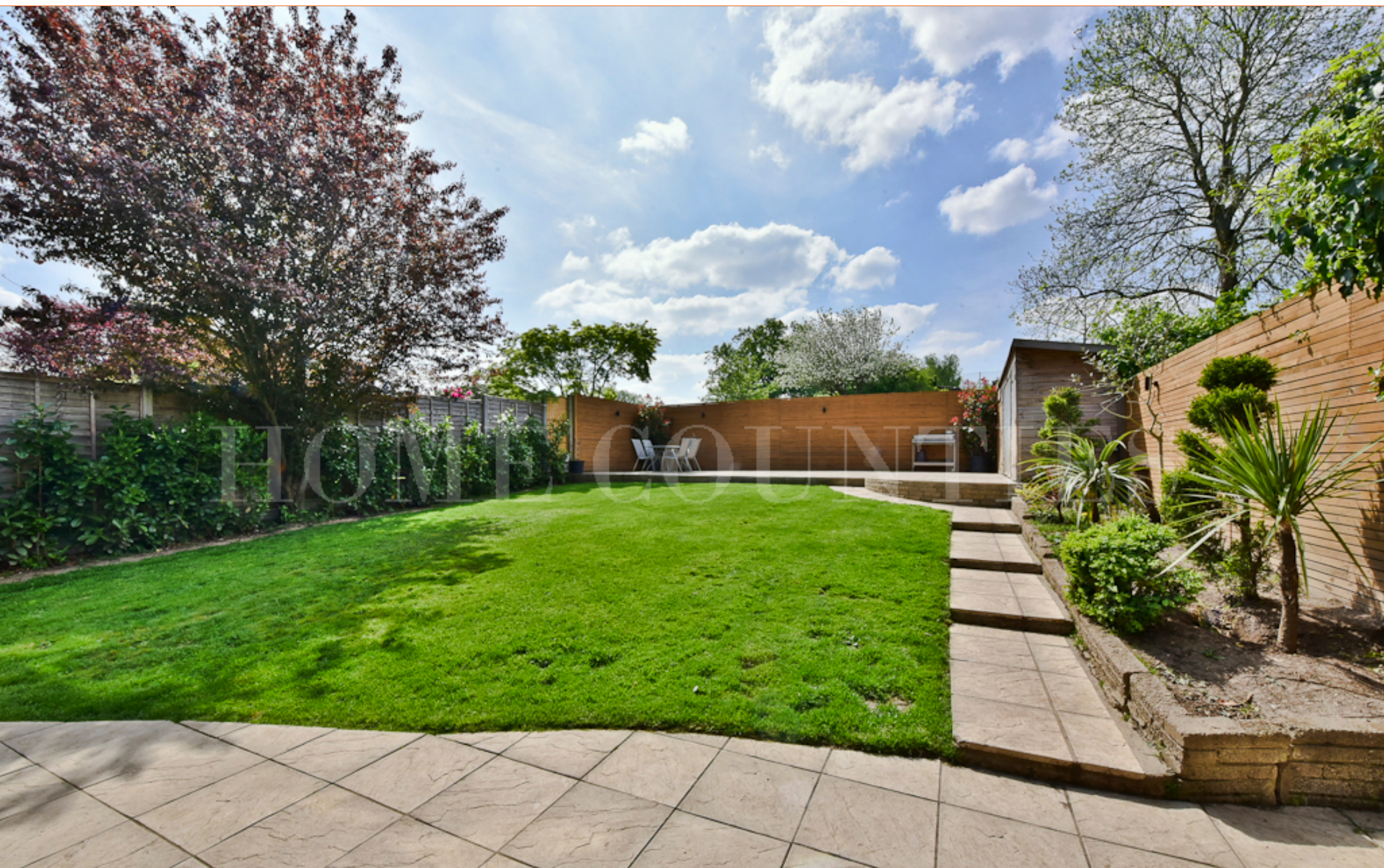
THE GREENWAY, POTTERS BAR, HERTFORDSHIRE. EN6 2NB