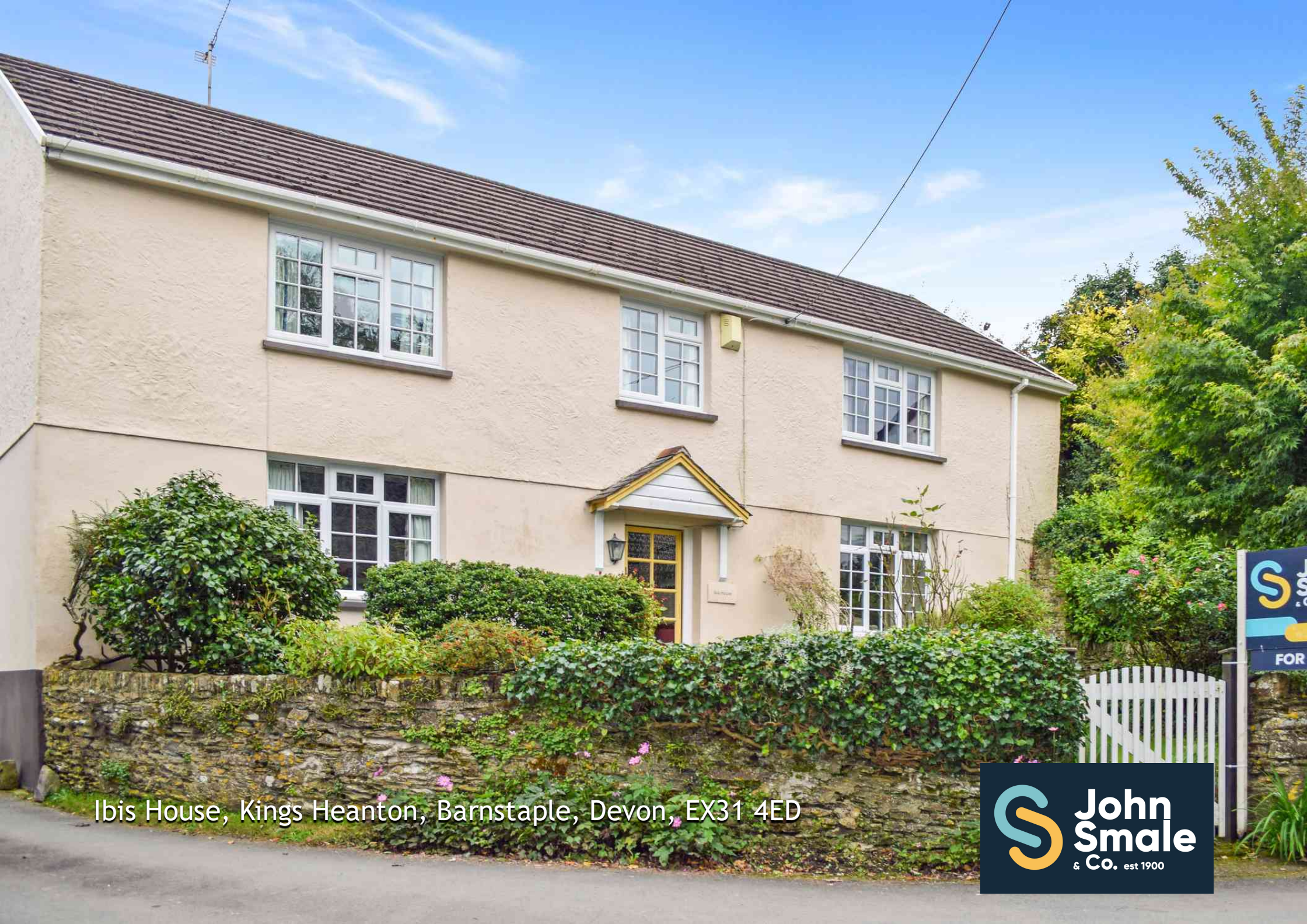
Ibis House, Kings Heanton, Barnstaple, Devon, EX31 4ED