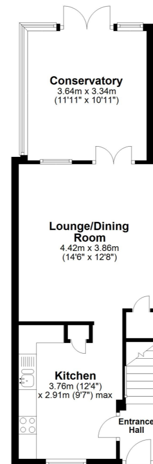
Ground Floor Approx. 44.4 sq. metres (478.3 sq. feet)