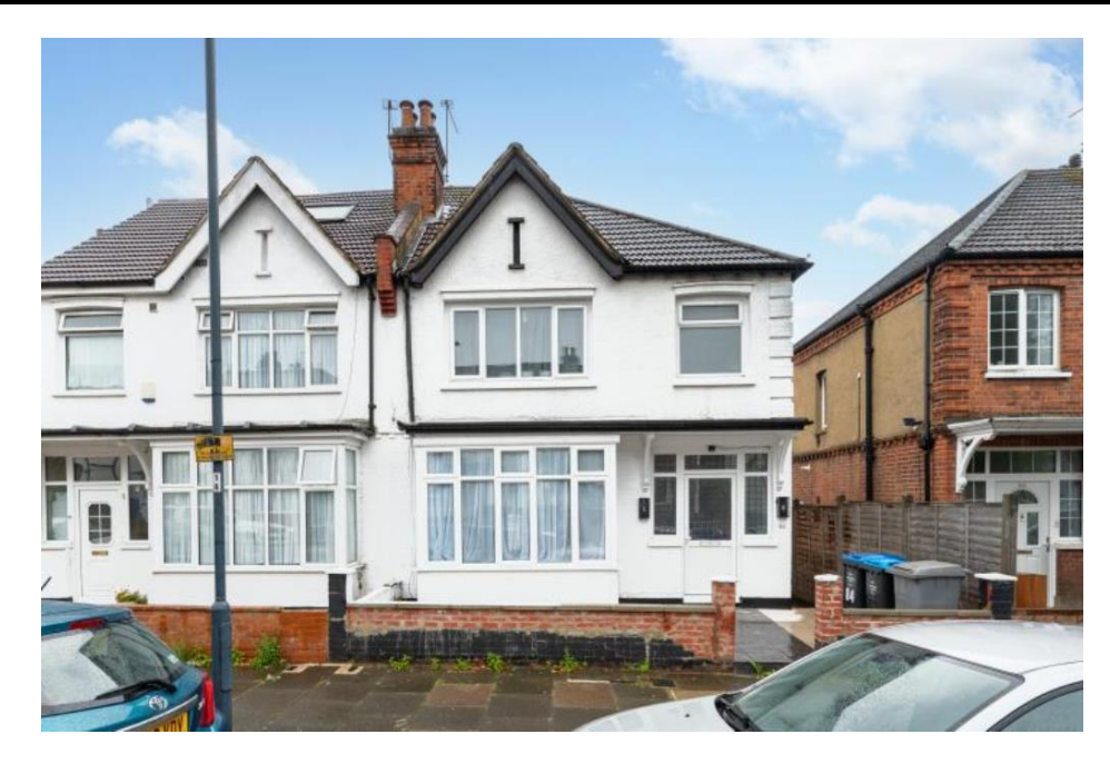
EPC Rating: D

A very well presented semi-detached late 1920's built house in this popular residential road parallel to Dollis Hill Avenue and located within a few hundred yards of the lovely 80 acres of Gladstone Park.