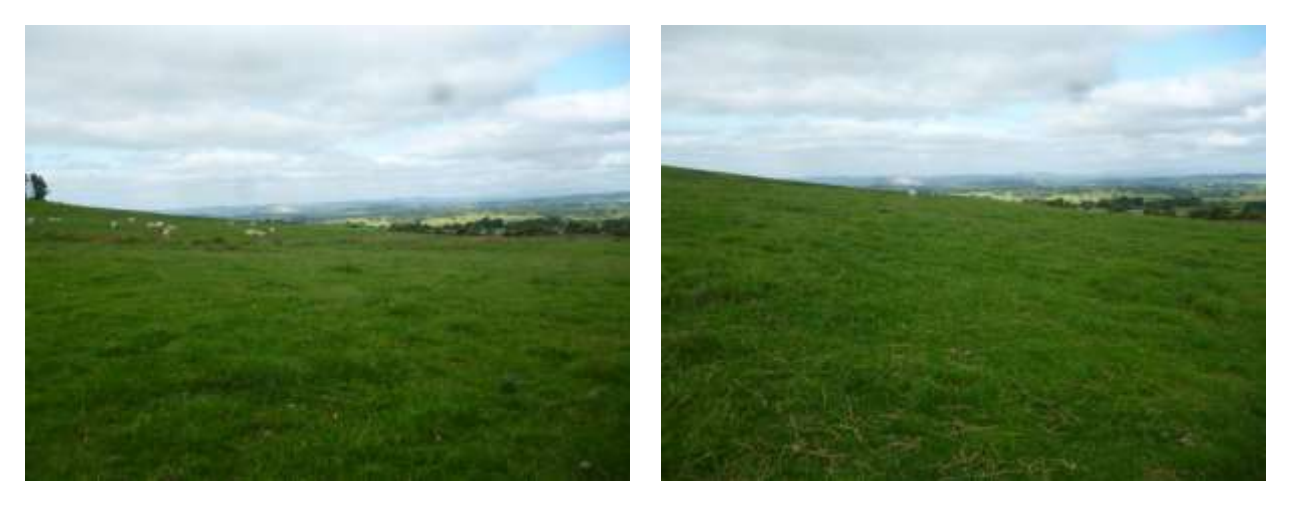
LOT 1 (Marked Red on the Plan)

This 10.18 acre plot comprises productive meadow or pasture land and is accessed from the road. There is a natural water supply running through the field.