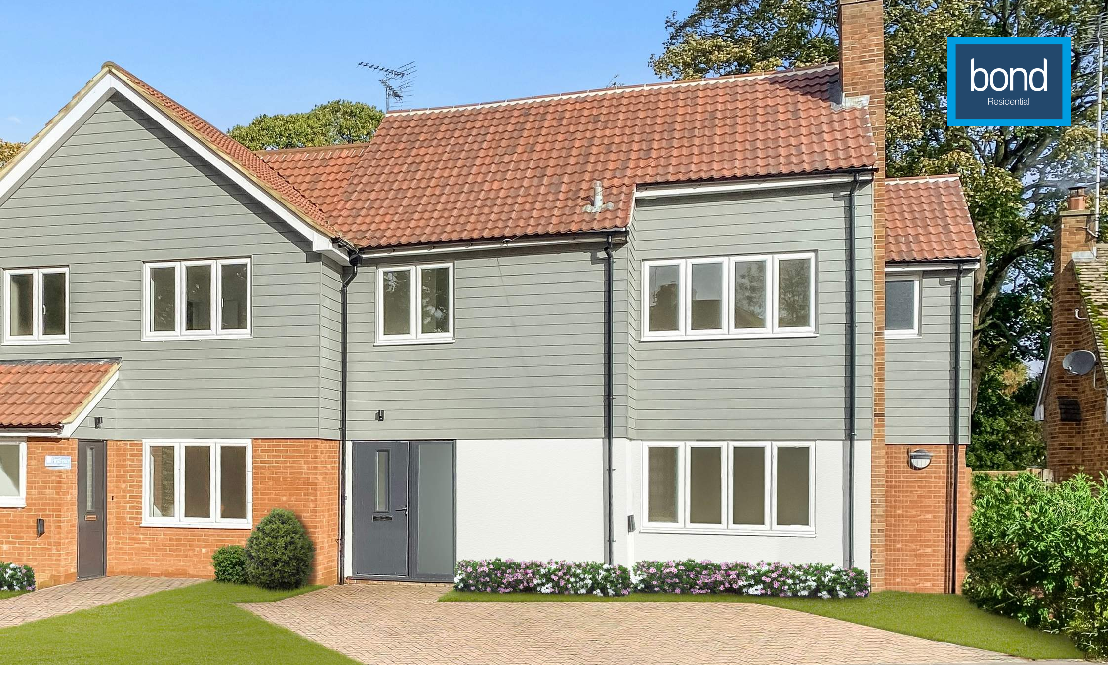
Oaklands Crescent, Old Moulsham, Chelmsford, Essex, CM2 9PP