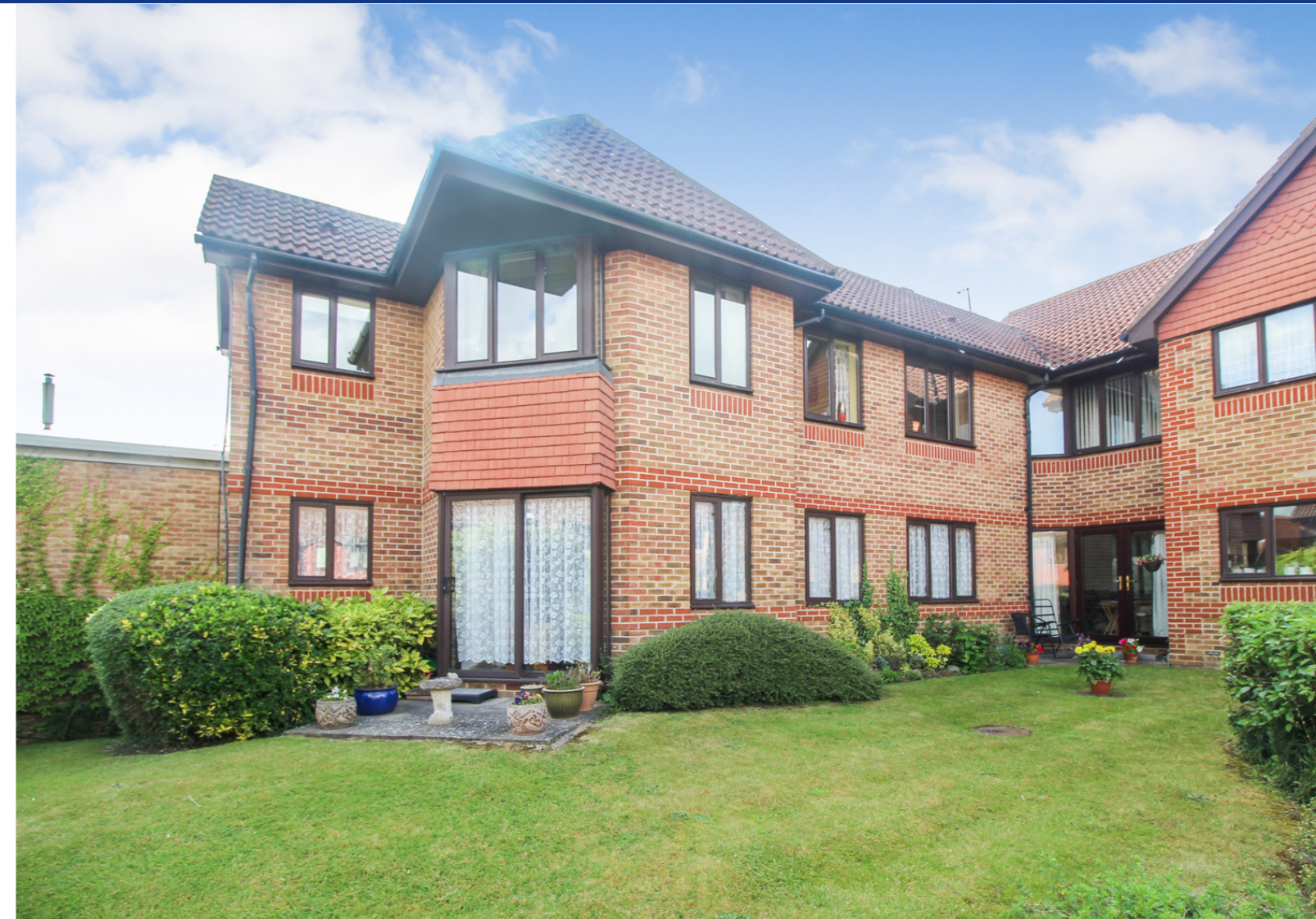
Burrcroft Court, Reading, Berkshire.

Whilst every attempt has been made to ensure the accuracy of the floorplan contained here, measurements of doors, windows, rooms and any other items are approximate and no responsibility is taken for any error, omission or mis-statement. This plan is for illustrative purposes only and should be used as such by any prospective purchaser. The services, systems and appliances shown have not been tested and no guarantee as to their operability or efficiency can be given. Made with Metropix ©2021