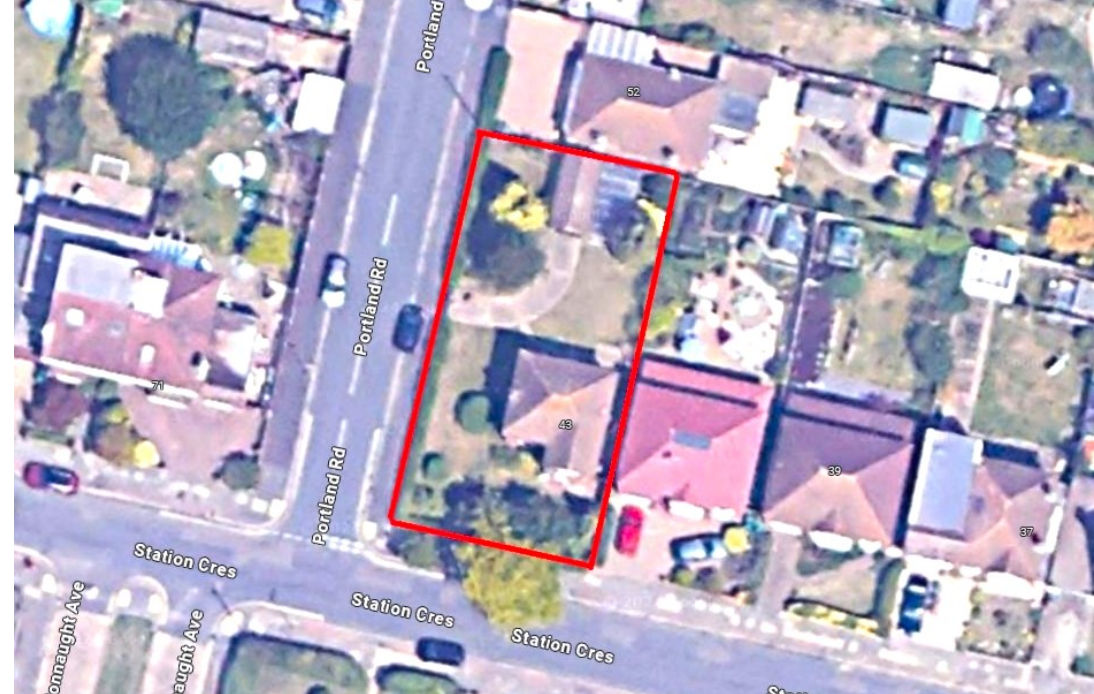
43 Station Crescent, Ashford, Surrey TW15 3HX £649,950 - Freehold