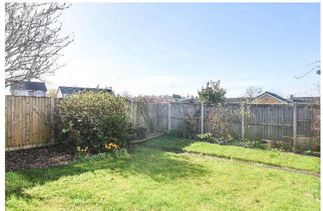
REAR OF THE PROPERTY & GARDEN

TENURE We are informed the tenure is Freehold.