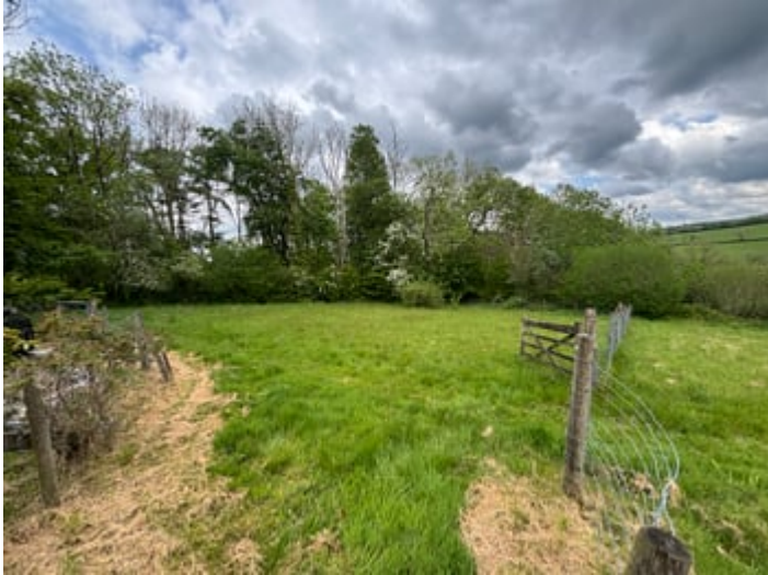
PADDOCK (SECOND IMAGE)

Two enclosures with gated access offering good grazing paddocks.