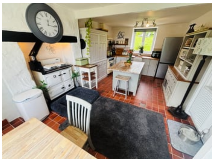
KITCHEN/DINER (FOURTH IMAGE)

20' 0" x 12' 0" (6.10m x 3.66m). A handmade Bespoke kitchen with a range of wall and floor units with hardwood work surfaces over, fitted Belfast sink, quarry tiled flooring, characterful fireplace housing a solid fuel Rayburn Range (currently not operational).