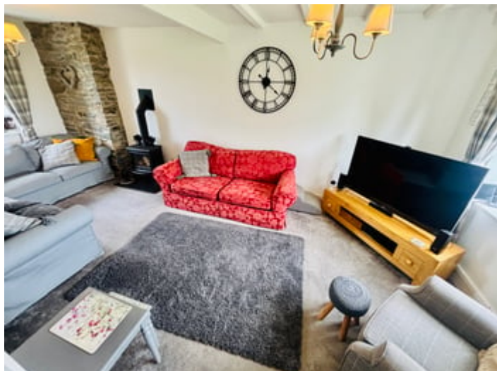
LIVING ROOM (SECOND IMAGE)