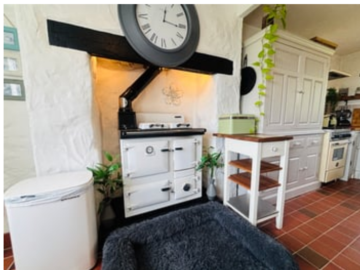
KITCHEN/DINER (FIFTH IMAGE)