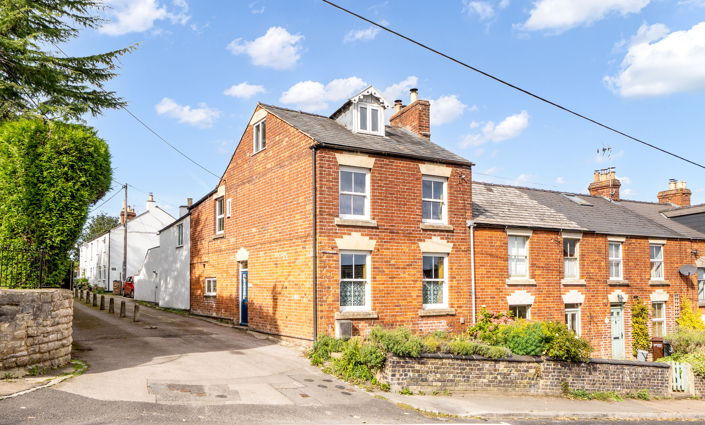
Richmond House, Rodborough Hill, Stroud, Gloucestershire, GL5 3SW £600,000