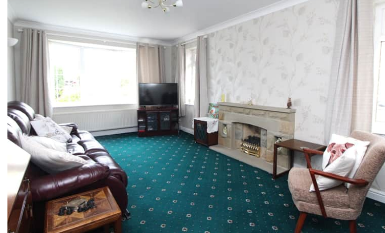
12 Cliffe Avenue, Harden, Bingley, West Yorkshire, BD16 1LN